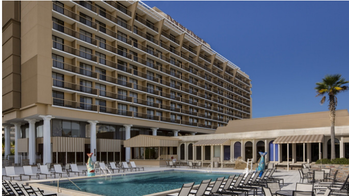
Hotel and pool facing the St. Johns River

The DoubleTree Riverfront offers spacious guest rooms and suites featuring complimentary Wi-Fi, a flat-screen HDTV, and a walk-out balcony offering excellent views of the St. Johns River or the City. Also available are Junior Suites for more space, superior views, and additional amenities, including a sleeper sofa, a microwave, and a mini-fridge.