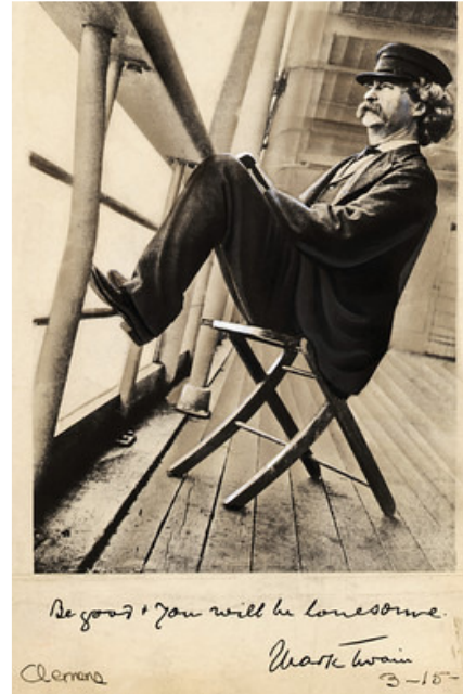
Mark Twain aboard SS Warrimoo

This ship was therefore not only in: two different days, two different months, two different years, two different seasons, but in two different centuries - all at the same time.