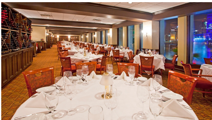
Spectacular views of Jacksonville skyline and the St. Johns River from Ruth's Chris Steak House

The DoubleTree Riverfront offers spacious guest rooms and suites featuring complimentary Wi-Fi, a flat-screen HDTV, and a walk-out balcony offering excellent views of the St. Johns River or the City. Also available are Junior Suites for more space, superior views, and additional amenities, including a sleeper sofa, a microwave, and a mini-fridge.